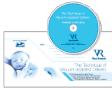
DVD: The Technique of Vacuum-Assisted Delivery DVD

The following resources are also available online at www.vaccaresearch.com through the link Clinician's Resources: